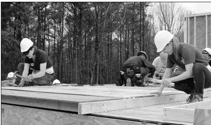
Women are regular volunteers for Habitat builds.