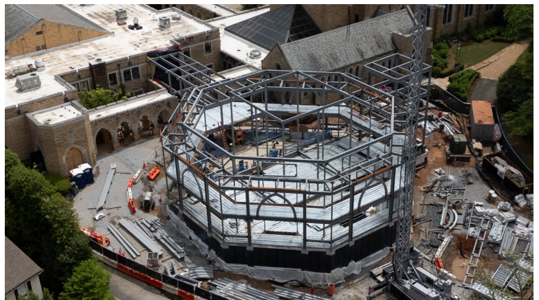
Good Faith Chapel construction continues, including temporary roof-bracing structure at center.