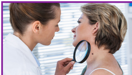
Free Skin Cancer Screenings May 3